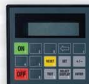
The DPC features a user-friendly push-button interface putting you in complete control.