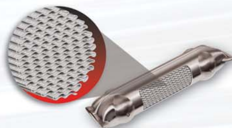
The heat exchanger features a unique corrugated stainless steel panel to help ensure reliability.